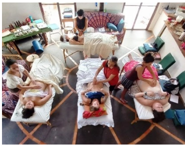
Class room at Arco Iris Farm

Book your place - Class is limited to 10 participants.