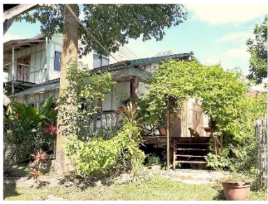
Arco Iris Permaculture Farm