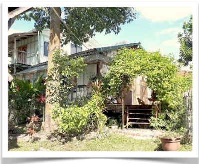
Arco Iris Permaculture Farm